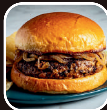
Sauteed Mushroom Burger RM 39

All price excluded 10% service charge & tax