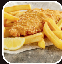
Fish & Chips RM 26