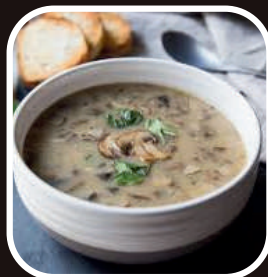
Creamy Mushroom Soup RM 18