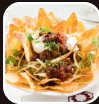
Nachos with Chessy Minced Dip RM 25