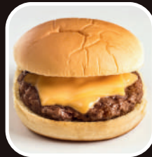
Cheeseburger RM 26

Shoestring Fries Add: Extra Cheese RM 2 Extra Bacon RM 5