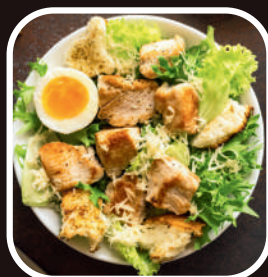
Classic Caesar Salad RM 19 Add: Egg RM 3 Chicken RM 5 Shrimp RM 7