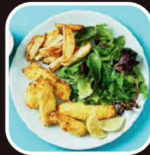
Fishless Fingers RM 39 wedges, green salad wasabi mayonnaise dip