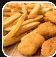
Chicken Nuggets & Fries RM 20