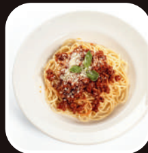
Spaghetti Bolognese RM25

Shoestring Fries Add: Extra Cheese RM 2 Extra Bacon RM 5