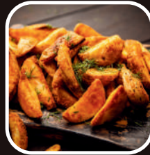
Cajun Potato Wedges RM 22