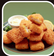
Chickless Nuggets RM 29