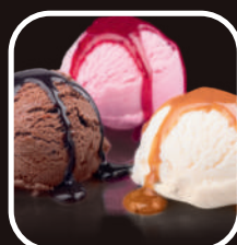
Ice Cream of the Day RM 12

All price excluded 10% service charge & tax