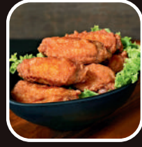
Shrimp Paste Chicken Wings RM 28