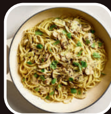
Mushroom Pesto Pasta RM 34