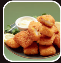
Chicken Nuggets RM 25