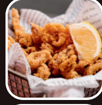
Fried Calamari RM 38