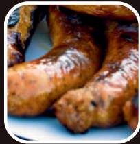
Chicken & Pork Sausages RM 48