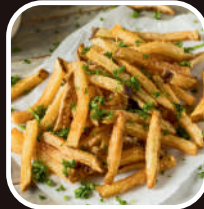
Parmesan Cheese Truffle Fries RM 25