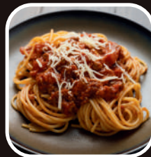
Spaghetti Bolognese (Vegan) RM 36