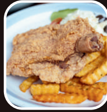
Crispy Chicken & Chips RM 22