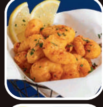
Crispy Fried Shrimps RM 32