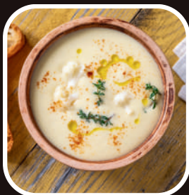
Corn Potage RM 18