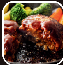
Beefless Hamburg Steak RM 42 wedges, broccoli, carrots