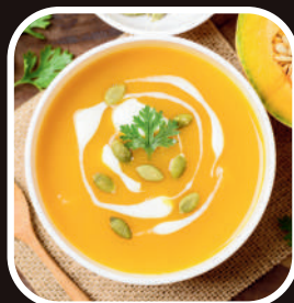
Creamy Butternut Squash Soup RM 18