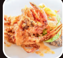
Crispy Fried Soft Shell Crabs RM 38

All price excluded 10% service charge & tax