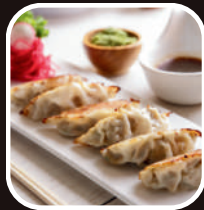
Gyoza RM 25